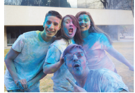
HAPPY HOLI FESTIVAL