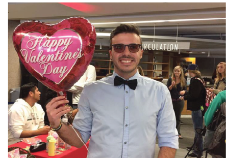
HUGS FROM AROUND THE WORLD